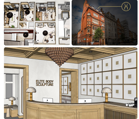
Elite Body Sculpture's London Location Opening 2023